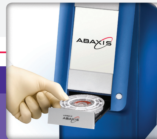
2 / Insert disc