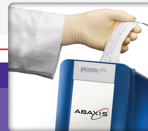
3 / Read results