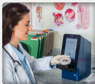
2 / Insert disc