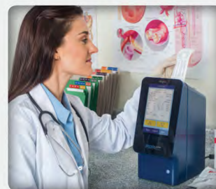
3 / Read results